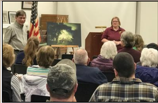
March 13 - Rambles Through History: Exploring the past along the Genesee Valley Greenway in the Town of Portage by Tom Cook