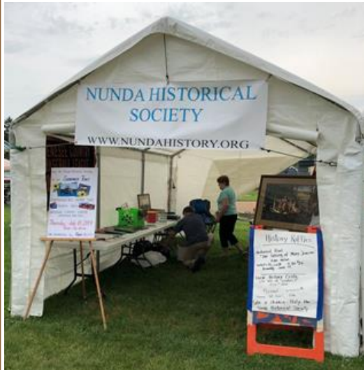
Nunda Fun Days May 30 - June 1