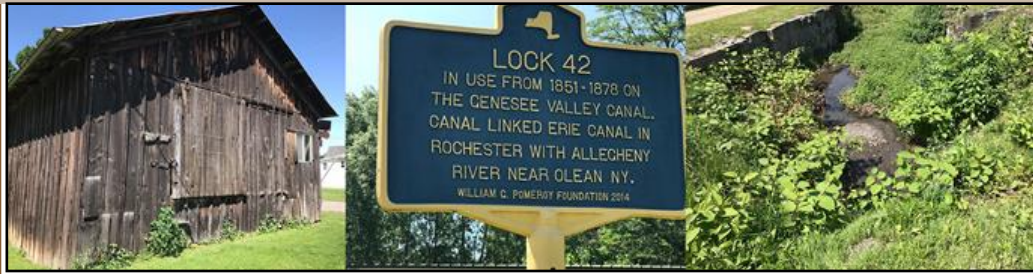
July 6 - Americana Day - Canal Walk in Nunda Village, Quilt Show, & Parade Float