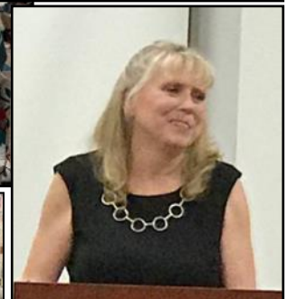
September 11 - History of Cartwright's Maple Tree Inn by Virginia & Rhonda Cartwright