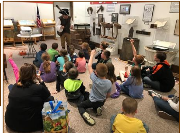
June 4 - First Graders Visit the Museum