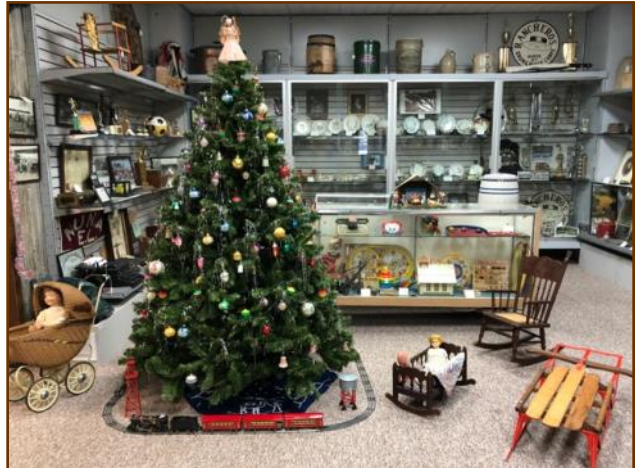
Dec. 14 - Christmas in Nunda at the Museum